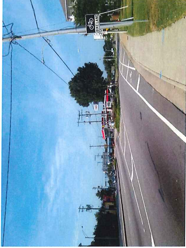
View from Granby Street Bridge coming into Riverview from north