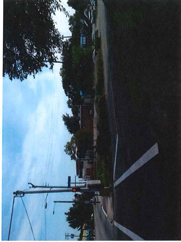
View coming into Riverview from the south