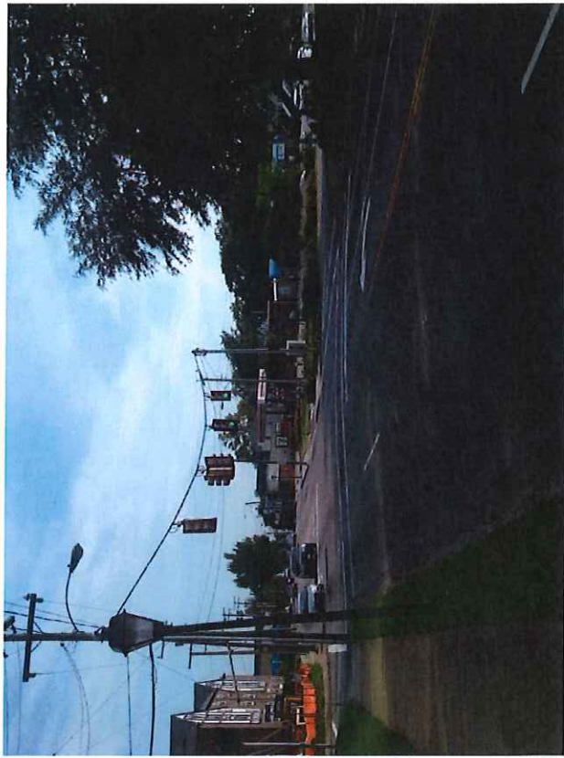
View coming into Riverview from the south