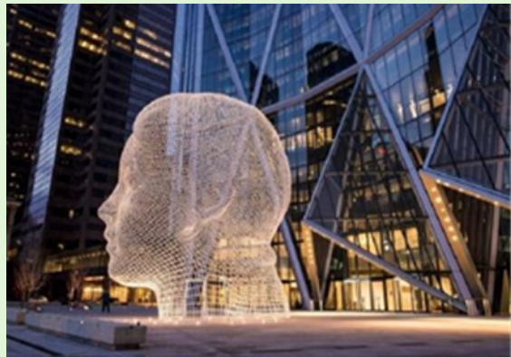
Wonderland by Jaume Plensa Bow Building, Alberta, Canada