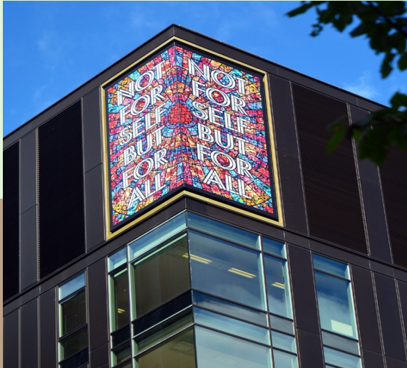
Not For Self But For All by Marc Titchner Kings Cross, London, England

Developers are encouraged to consider creative ways to incorporate public art into their projects. Up to $25K is available from the City of Norfolk Public Art Program.