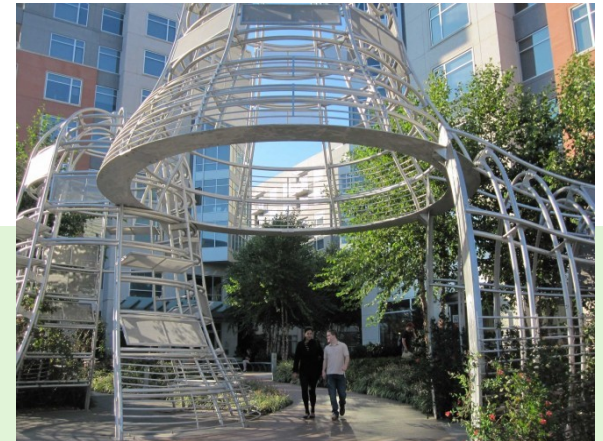
Wave Forms by Dennis Oppenheim Housing complex, 34th & Chestnut, Philadelphia, PA

Public Art is an integral element in Norfolk's landscape & a proven tool for creating dynamic spaces. Public Art infuses new developments with a strong connection to the community helping to express & shape the Norfolk identity.