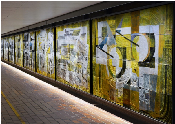
Ceramic Mural by Dorothy Annan The Barbican, London, England

Eligible project sites will be located within Norfolk city limits & at the most visible location on project grounds in order to engage the maximum amount of viewers. Artwork can be placed on a wall, window, floor, hung from the ceiling or be free-standing on the exterior or interior.