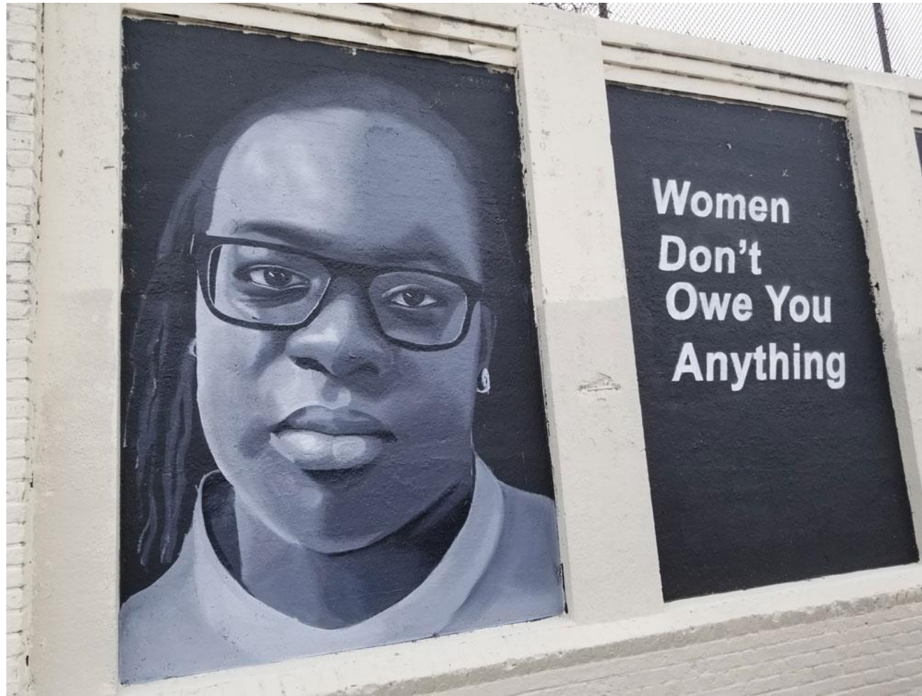
Tatyana Fazlalizadeh, Commission on Human Rights NYC Create large street portraits of women that call out gender-based street harassment and anti-black street harassment. https://municipal-artist.org/profiles/public-artists-in-residence/